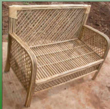
Two seater sofa